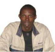
AMOS - Rukungiri