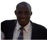
SAMSON - Mbarara