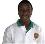
AINE - Kabale