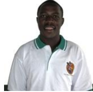
JOSHUA - Kisoro