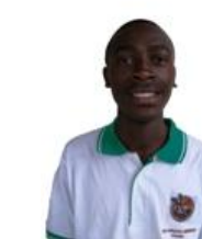
ABAHO - Kabwohe