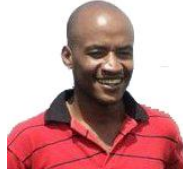
MEDARD - Ntungamo