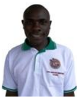
ALEXANDER - Kabale