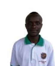
JOSHUA - Kamwenge