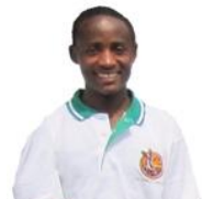
AMON - Mbarara