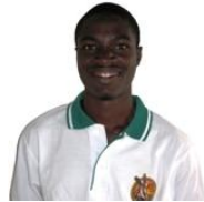
WYCLIFFE - Mbarara