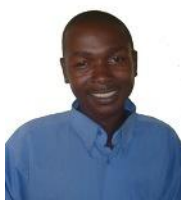
ISAAC - Rukungiri