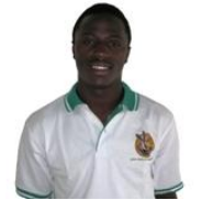
RODGERS - Lyantonde