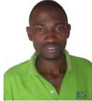
NICHOLAS - Bushenyi