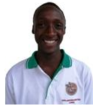
DANCAN - Kabale