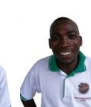
GAD - Kabale