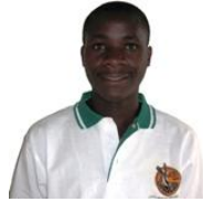
LABAN - Kabale