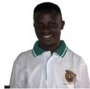
PRESTON - Kamwenge