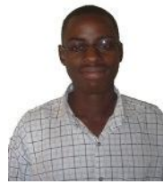
MEDARD - Ntungamo