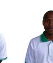
DARLINGTON - Ntungamo