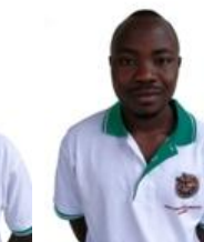
ANTHONY - Bushenyi